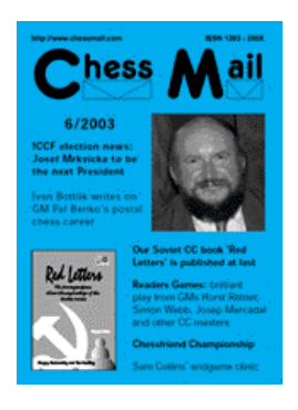
Single £4.00, Annual £30.00