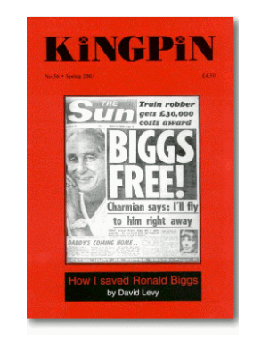
Single £4.50, Annual £12.00