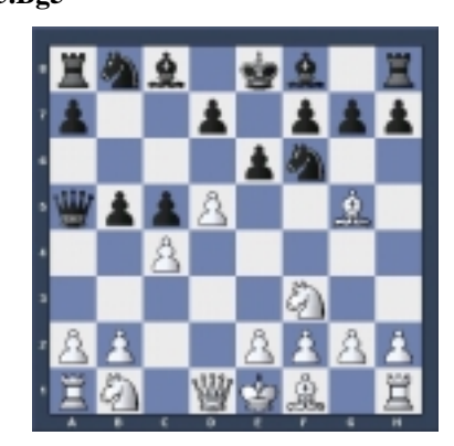
This is the Gambit Declined.