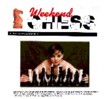
Single £2.50, Annual £27.50