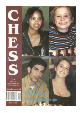
Single £3.50, Annual £34.95