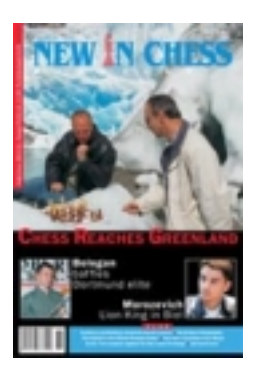
Single £5.95, Annual £42.00