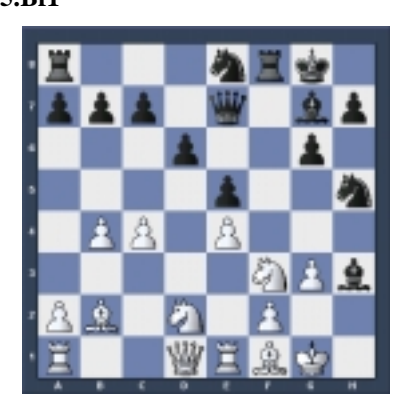
The plan of 15.Bf1 and Bg2 allowed me

12... fxe4 13.dxe4 Bxh3 14.Re1 Qe7 15.Bf1